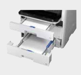
500-sheet paper cassette